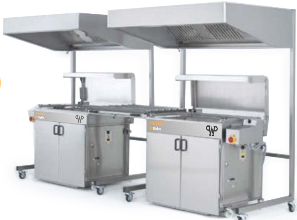
The extractor hoods shown are optionally available.