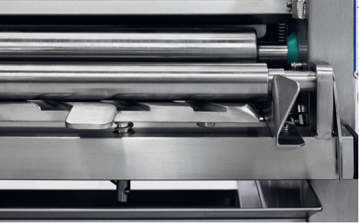
■ Pre-scraper with spring pressure