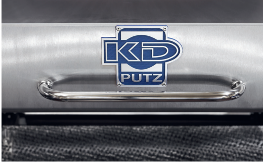
■ Fold-up cover in stainless steel